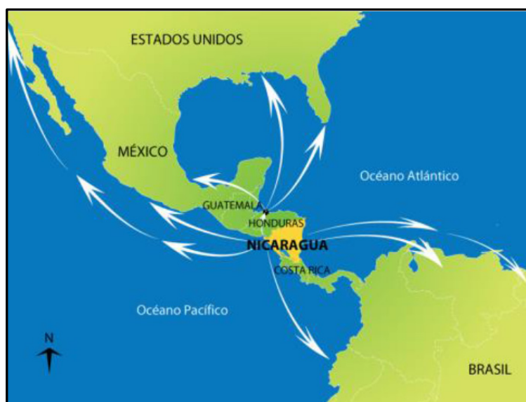
Nicaragua – the Centre of the Americas...

About Oro Verde Limited: Oro Verde Ltd is a mineral exploration company focused on identifying and developing significant gold projects in Central America, particularly Nicaragua. Oro Verde is currently undertaking Due Diligence to finalise an Option to Purchase Agreement on the Topacio Gold Project in Nicaragua that currently contains a NI43-101 compliant Inferred Mineral Resource of 340,000 ounces of gold. Oro Verde also holds 100% of the early stage San Isidro Gold Project located adjacent to the 2.4 million ounce La India gold project.