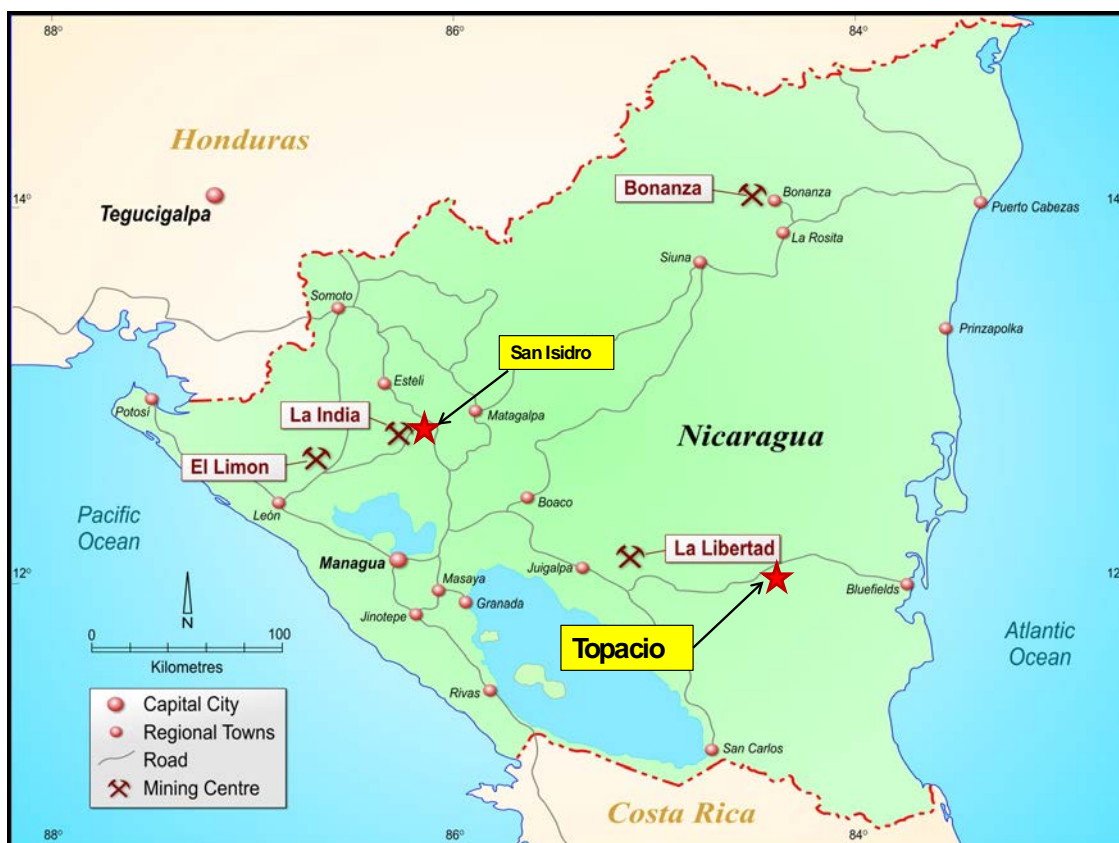
Figure 1 Major Nicaraguan gold deposits and the location of the Topacio Gold Project

The project is located in the South Atlantic Autonomous Region in southeast Nicaragua (Figure 1) which has a hot, humid, tropical climate with a pronounced wet season (May-December) and a short dry season (January-April). Relief in the concession area is modest and is principally rolling hills covered by cattle pastures and secondary growth tropical forest. Access is excellent with paved Highway 7 to within 3 km of the main area of drilled resources in the concession.