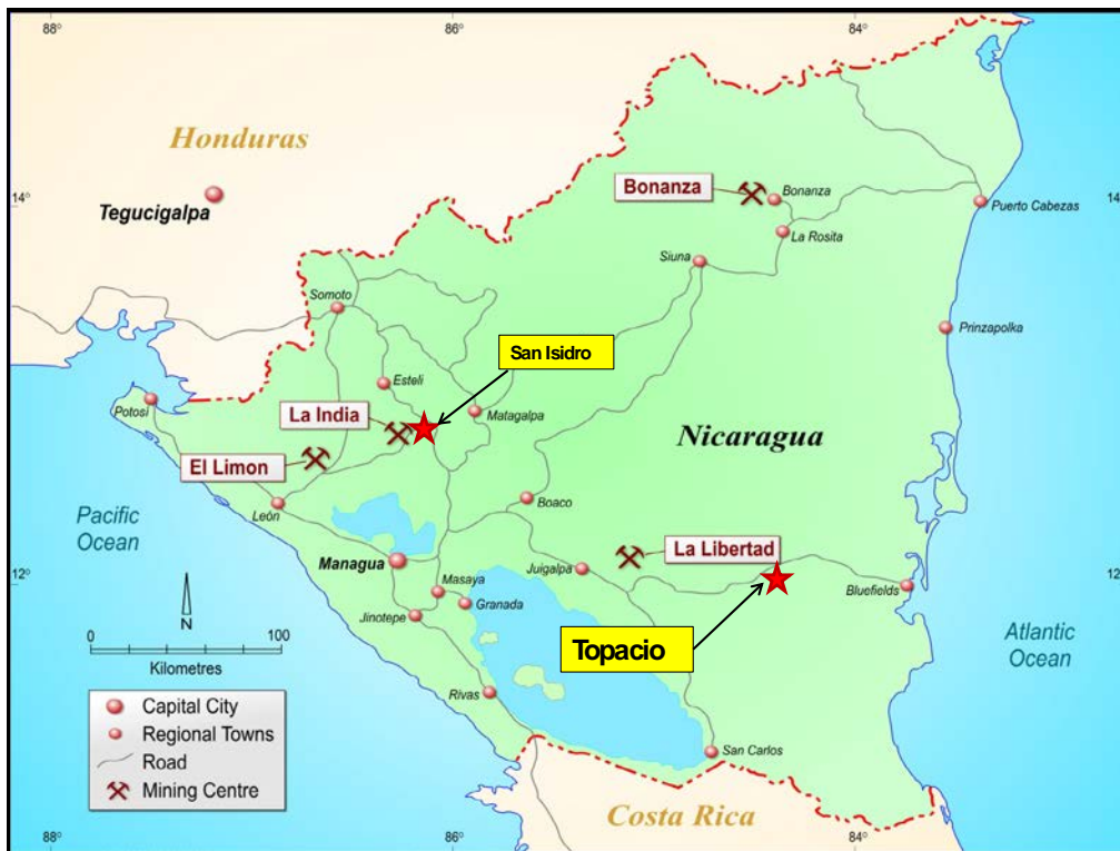
Figure 1 Major Nicaraguan gold deposits and the Topacio Gold Project

will be critical in defining drill targets to test the extent of the low sulphidation epithermal system and hence expanding the existing Topacio gold resource.”